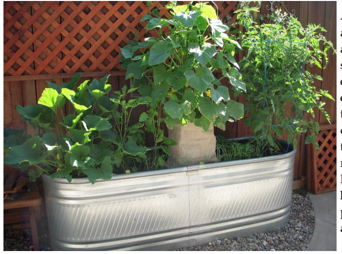
Vegetables Growing in Galvanized Container

Large metal containers are gaining popularity as an option for raised bed plantings. Available in a variety of shapes and sizes, galvanized stock tanks require no assembly and sit at just the right height for tending vegetables or flowers. My initial introduction to these containers was during an early April visit in to Petaluma's Cottage Gardens nursery. A month later I had my own oval shaped 2'x2'x6' container sitting in my side yard filled with 14 bags of soil (½ cubic feet each). I found exactly the size I wanted at Western Ranch in Vacaville which offered a wide range of choices including home delivery.