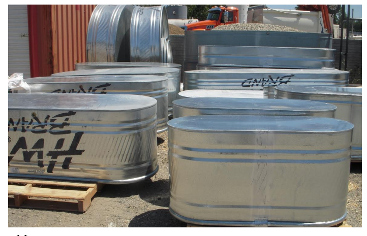
More Sizes and Shapes of Galvanized Containers

galvanized steel in addition to fencing used around gardens. worrying about every possible contaminant. Yet a salvaged (Visit http://wikipedia.org/wiki/Galvanization for a detailed description of galvanization. For more on the safety of galvanized wire, check out www.motherearthnews.com/ organic-gardening/galvanized-wire-zb0z09zblon.aspx).