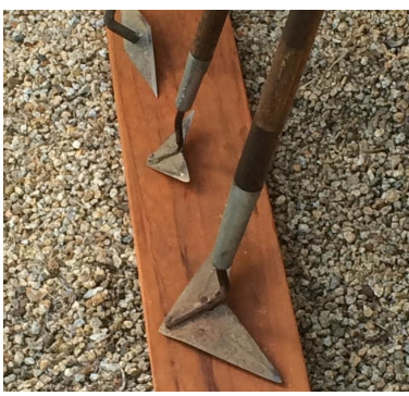
Scuffle Hoe