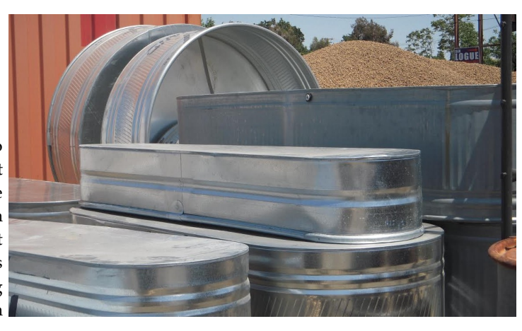
Various Shapes of Galvanized Containers

At the time of this writing, a zucchini, tomato and a cucumber vine are thriving inside the tank along with two sweet banana peppers and two basil plants, plus a row of long white bunching onion sprouts. I admit I pushed the planting space to the limit to experiment with what grows well and what doesn't. I'm already eating zucchini and basil and within days will savor the first fruit of the tomato. Watering is a learning experience. With normal 80 degree days I get by watering three times a week but when temperatures climb above 100, it's daily. Meanwhile, while researching others' experiences in using these galvanized containers, I discovered that the Internet is aflutter with fear over possible harmful chemical contamination from galvanized items. Most people worry they will be poisoned by zinc leaching into the soil and being absorbed by the plants.